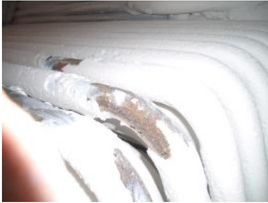
Silicon dioxide deposits on boiler tubes