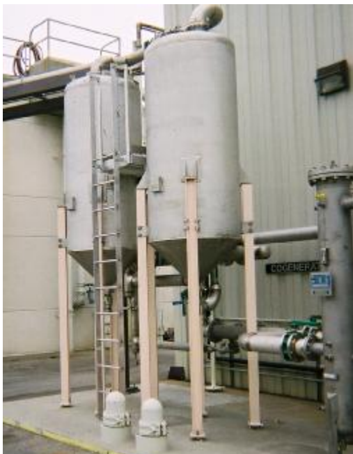
Santa Cruz Siloxane Removal System

Below are pictures of the Santa Cruz and Stockton siloxane removal systems: