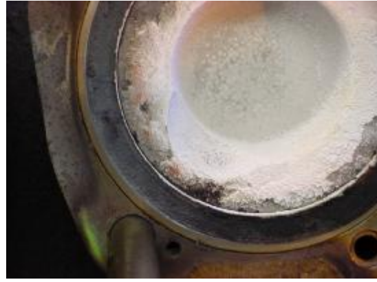
Silicon dioxide deposits on piston crown.

Obviously, this boiler was not performing very well when the silicon dioxide built up this thick layer of deposits. Because there can be other minerals in digester gas, the silicon dioxide deposit can also be grayish, tan, or brown in color. To the right is a picture of a piston crown in an IC engine that suffered severe silicon dioxide and silicate damage. This engine has to be completely re-built at a cost of around $90,000.