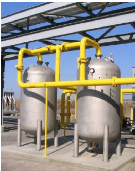
Stockton Siloxane Removal System